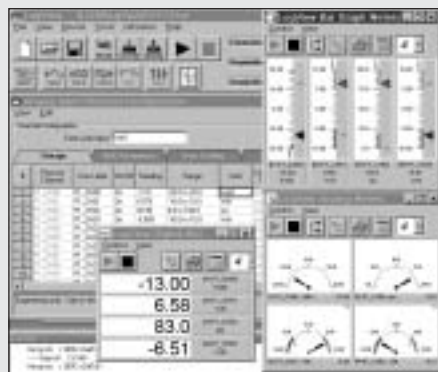
LogView requires no programming or block diagram configuration